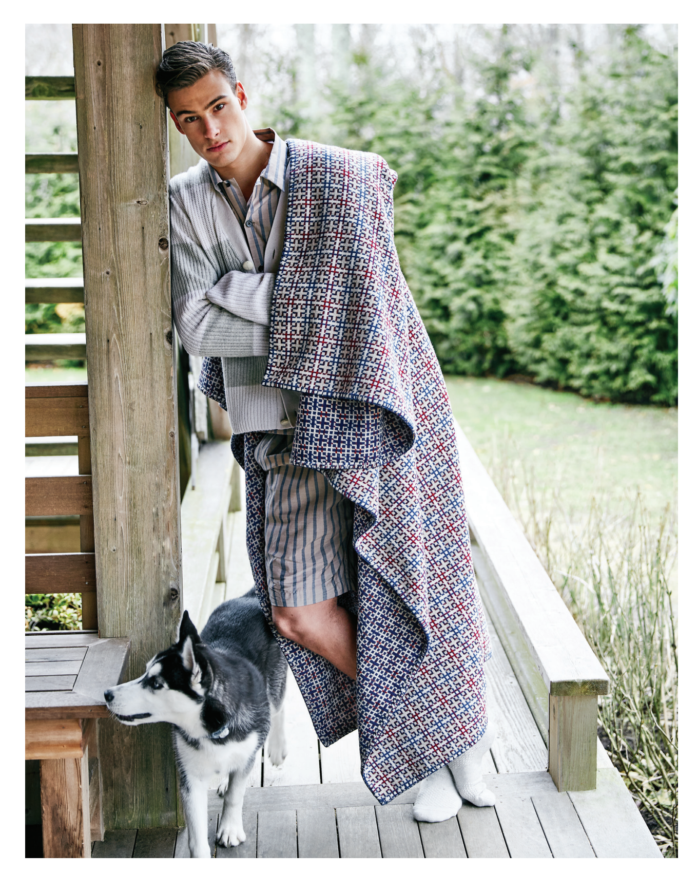
Cashmere striped cardigan, $625, henley stripe Lake shirt, $275, and Luis henley stripe shorts, $375, all at joseph-fashion.com; cotton socks with bee embroidery, $120, at Gucci, NorthPark Center; wool throw blanket, $1,650, at Hermès, Highland Park Village.