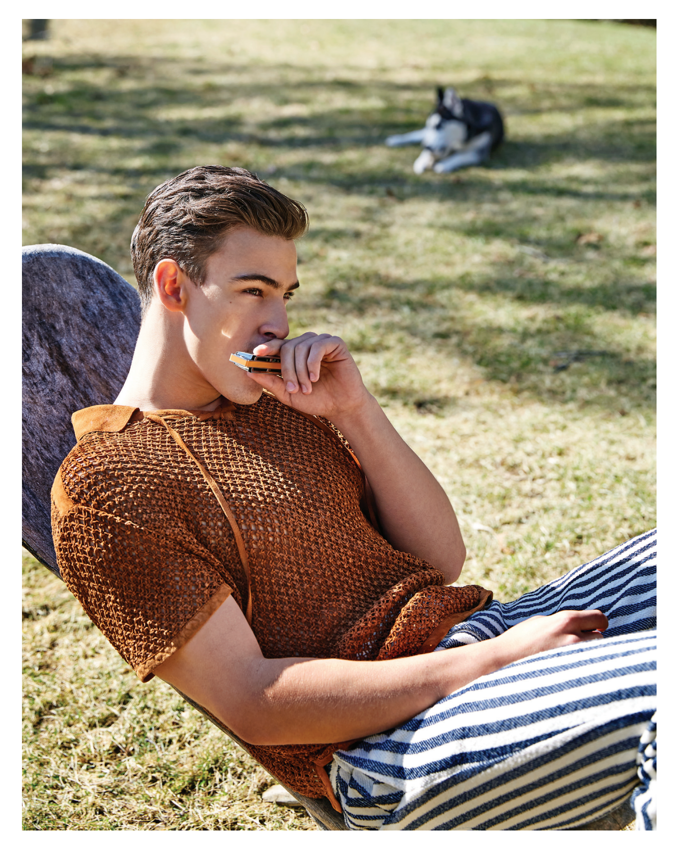
Knit leather top, $450, BOSS, NorthPark Center; striped jogger trouser, $570, Etro, Highland Park Village. Opposite page: Cotton shirt, $520, and mohair knit vest, $670, both at marni.com; relaxed cotton trousers in Toffee, $520, at pringlescotland.com.