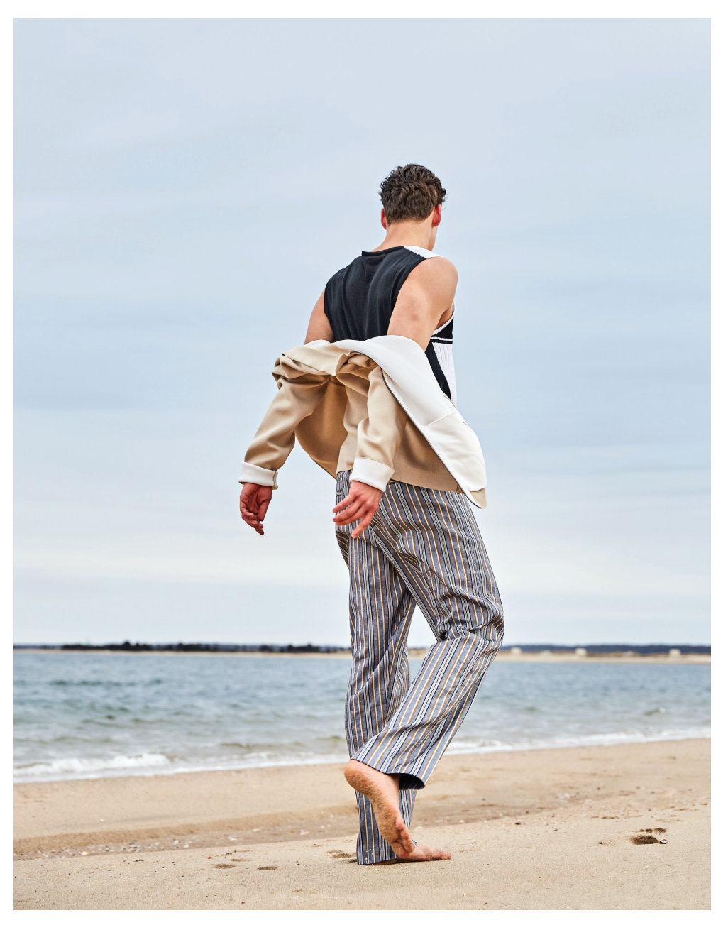
Beige silk and cotton zip-up jacket, $1,730, by Berluti at Forty Five Ten; linen and cotton tank top, $1,075, at Hermès, Highland Park Village; multicolored striped trousers, $467, at andreapompilio.it.